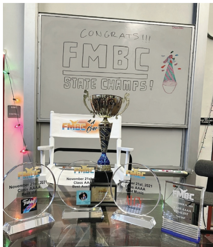
FMBC championship trophy