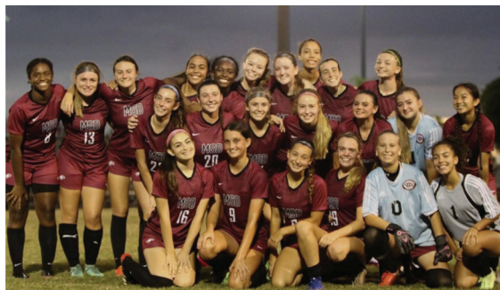
Marjory Stoneman Douglas girls soccer