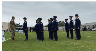
Coral Springs High's AFJROTC team competing in various exercises