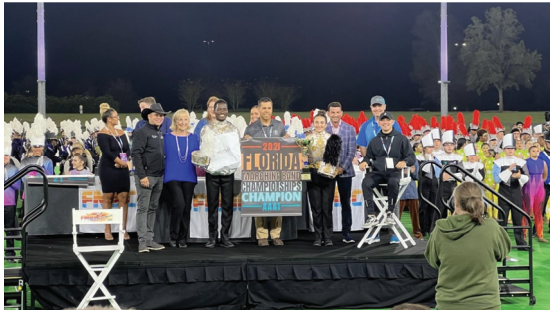
Presentation of FMBC championship trophy