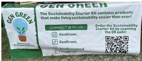
Gen Green banner at the Farmer's Market