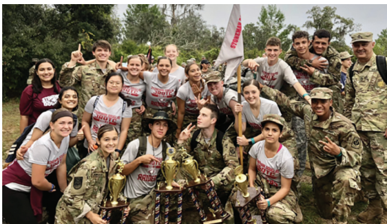
Marjory Stoneman Douglas Junior Reserve Officers Training Corps

In January, MSD's Girls Soccer Team won their 24th District Championship!