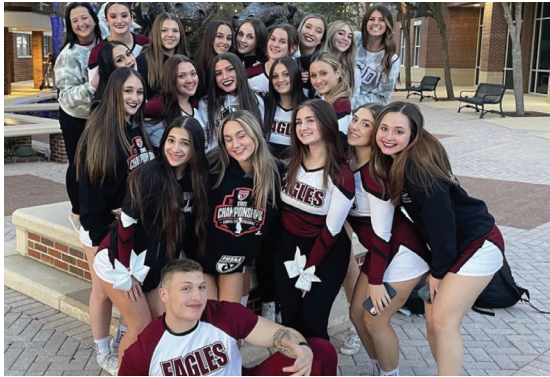
Marjory Stoneman Douglas Cheerleading Squad